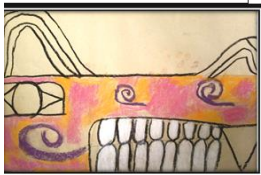
Elementary Winner Gr 2 Kary Mather-Whyte Monster Teeth/Pastel $25.00 PUNTLEDGE ELEMENTARY Teacher: Thea Black